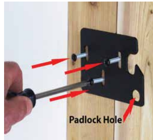
4. Place strike plate on gate post and align padlock holes with latch. Install three screws. Slots allow vertical adjustment.