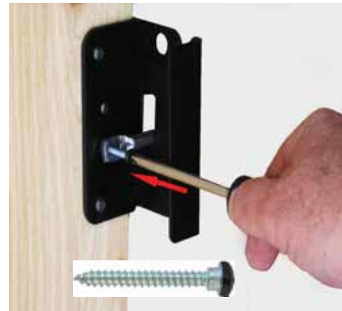
3. Mount strike bar to front of latch using the lower hole. Use screw with shoulder.