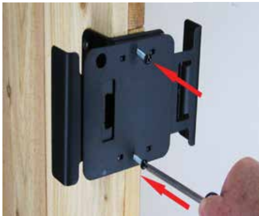
1. Attach latch to side of gate with two screws

Recommend 1/8" pilot holes for all screws