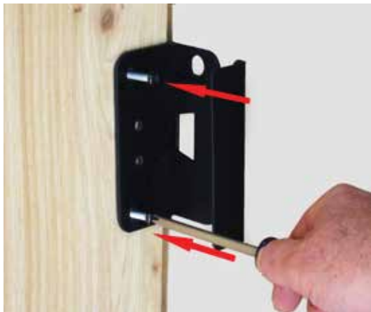
2. Secure latch to front of gate with two screws